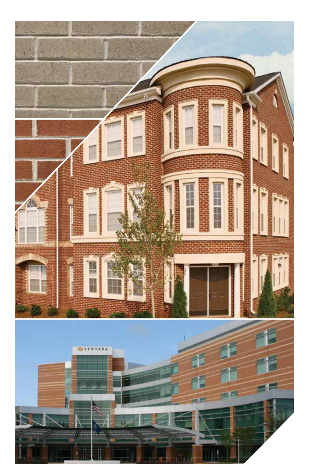
Tan Velour Modular and Oatmeal Velour Modular

Other brick options range from traditional reds and earth tones to pastel pinks, misty grays, browns and deep burgundies. In addition, we provide smooth to heavily-textured bricks that can help you create any look you desire.