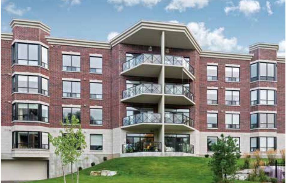
Brick Product: Arriscraft Renaissance® Nutmeg Sandblasted