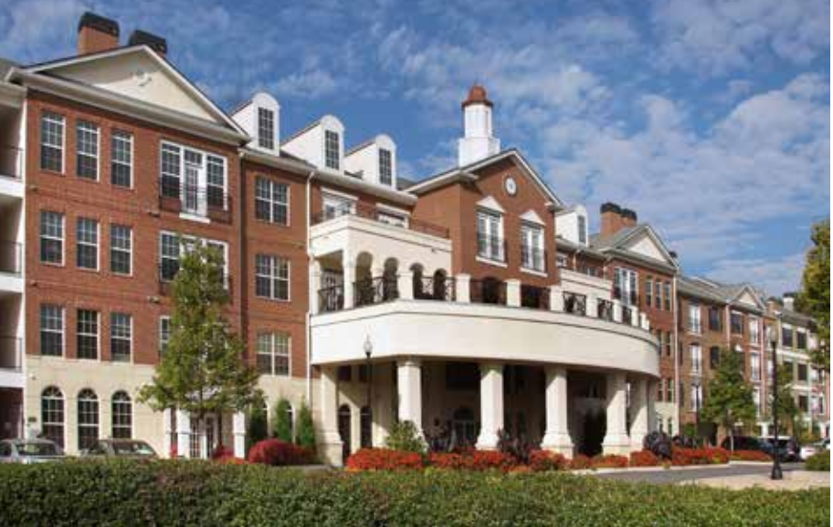
Brick Product: Millstone, Autumn Ridge and Berrywood