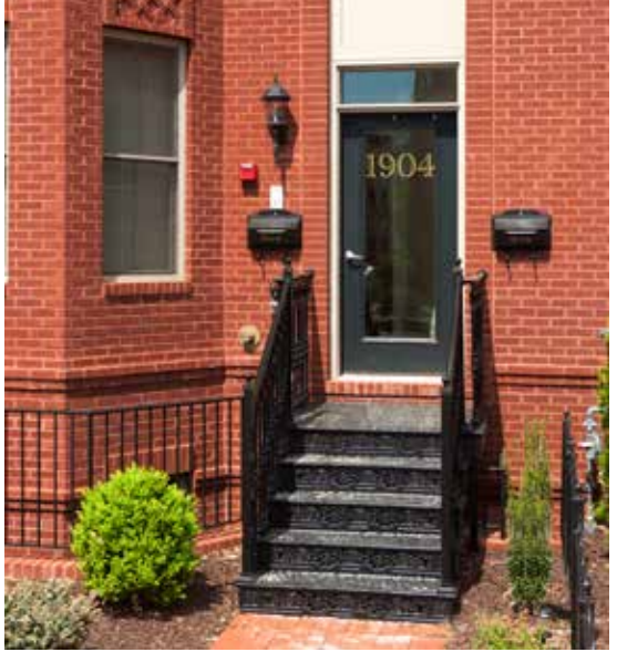
Brick Product: Red Range Smooth