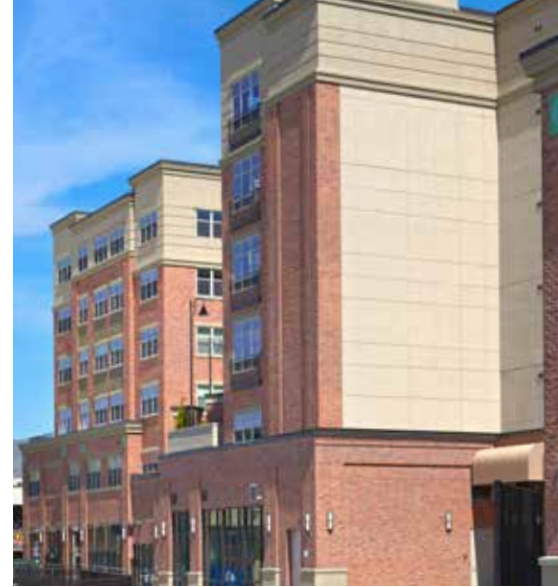
Thin Brick Product: Frenchquarter