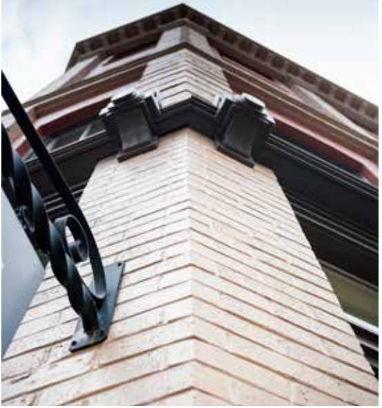
Brick Product: Custom brick made in Marion