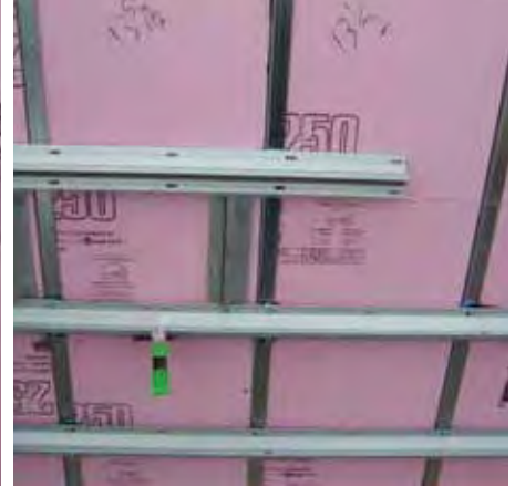
Step 5: Install Gridworx Channels over "Z" channels and rigid insulation