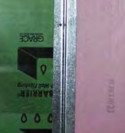
Step 4: Install "Z" channels and then Rigid Insulation between "Z" channels