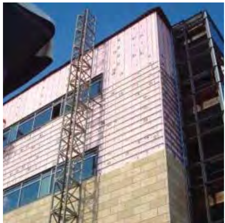
Step 6: Clip Stone on to the Gridworx Channels