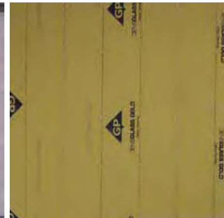
Step 2: Exterior Grade Sheathing