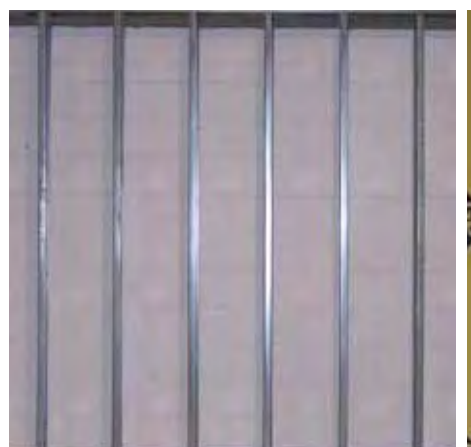
Step 1: Steel Studs