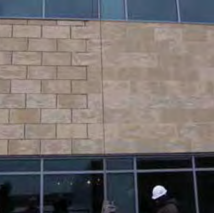
Step 7: Joints Sealed with Backer Rod and Silicone Sealant