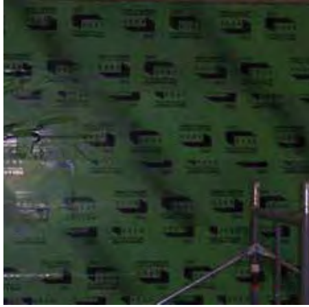
Step 3: Waterproofing Membrane