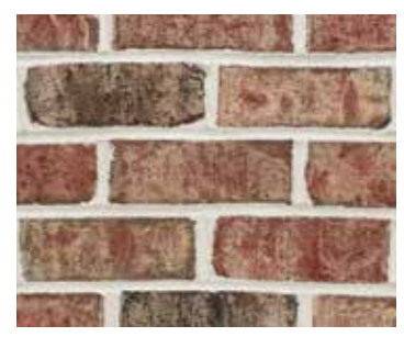
Salem Creek Tudor | LWM, LWQ, LWE

Photo samples are intended to represent general color range and texture. Precise color fidelity is difficult to obtain in print. Brick selection should be made from product samples.