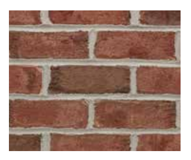
Old English Tudor | LWM, LWQ, LWE