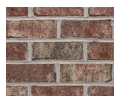
Mountain Stone Tudor | LWM, LWQ, LWE