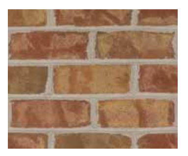
Rose Range Tudor | LWM, LWQ, LWE