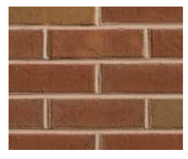
Annapolis | LWM, LWQ, LWE