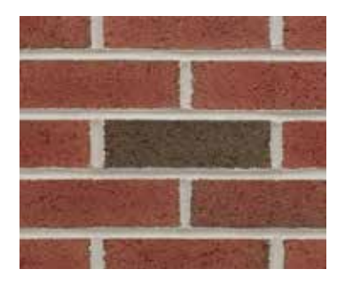
Raleigh Court | LWM, LWE