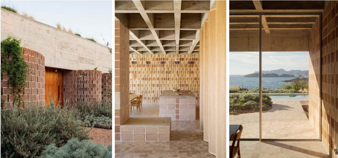
Ca na Birgit_Ted'A arquitectes @Luis Diaz Diaz

traditions, melding a spiritual aesthetic with contemporary life to create a sense of serenity across the 5,000 sqm site. The carbon-negative project upcycled some six million clay tiles sourced from more than 500 local homes, creating a unique and sacred connection with the people of the region.