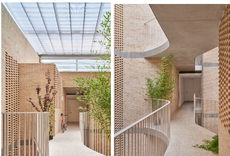
Social Atrium - 54 Dwellings in the Besòs_Peris+Toral Arquitectes

The Feeling at home category was won by Ca na Birgit (Birgit's Home), designed by TED'A arquitectes. Built on the cliffs of Ses Penyes Rotges in the west of Mallorca using locally sourced brick, the open-plan, single-family home encompasses a built area of just 194 sqm. The design sensitively addresses the demands of the local climate and environment while responding with ingenuity to the limitations imposed by the location. On the one hand, the house has to look out to the sea, while on the other, it has to be shielded from the neighbors' sight. The project is based on a single gesture that solves both issues: it defines two deep walls set parallel to the neighboring properties, which frame the sea view while providing privacy.