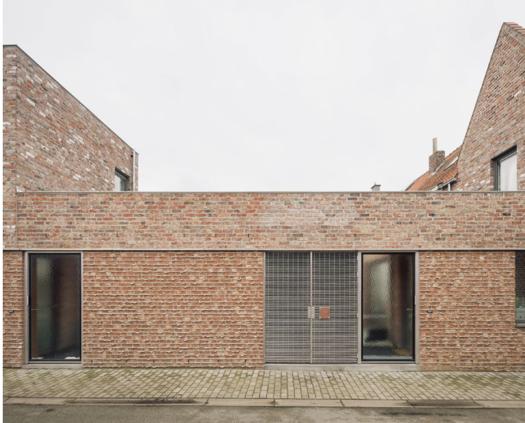
A social and urban infill project in Kortrijk – MAKER

In addition, the jury decided to award a Special Prize to an innovative common living concept. This social and urban infill project in Kortrijk, Belgium, reimagines a neighborhood of 54 homes as a contemporary garden city, fostering stronger connections between residents and the surrounding nature, while reinforcing social and environmental bonds. The architecture is shaped by reuse, with reclaimed bricks and tiles forming facades that reflect the availability, history and character of the materials.