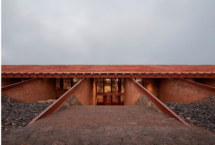
Warehouse and Offices for Clase Azul La Hacienda Jalisco_Atelier Ars

biomass-fired brick used in the interior and exterior facade keeps the building warm in winter and cool and ventilated in summer.