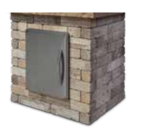
SINGLE DOOR CABINET