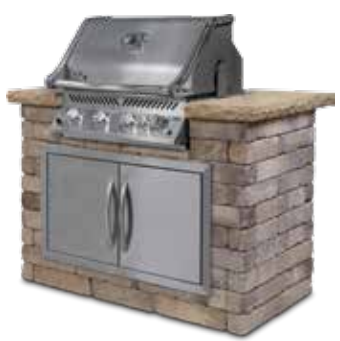
500 GRILL CABINET