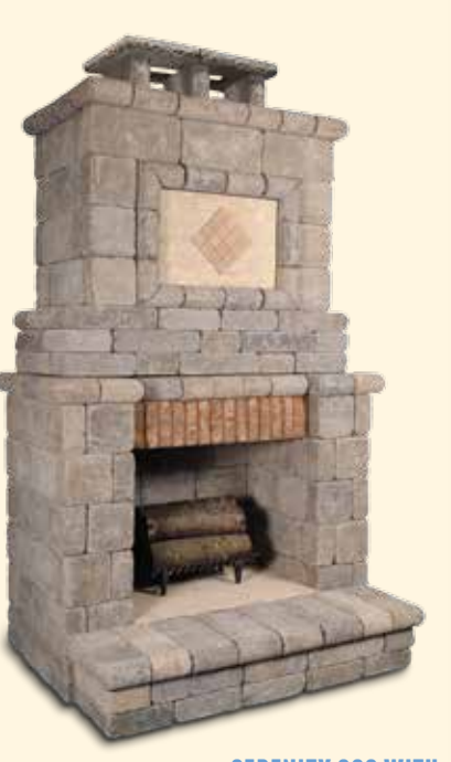
SERENITY 200 WITH THIN BRICK UPGRADE