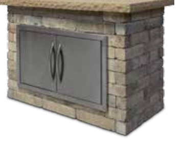
DOUBLE DOOR CABINET