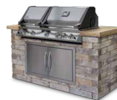
750 GRILL CABINET