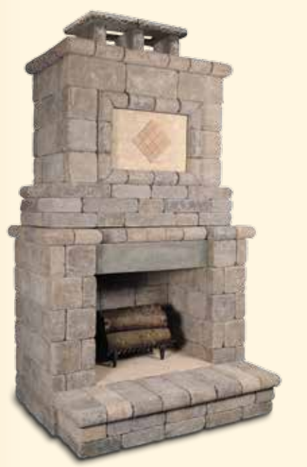
SERENITY 200 WITH SMOOTH-FACE LINTEL