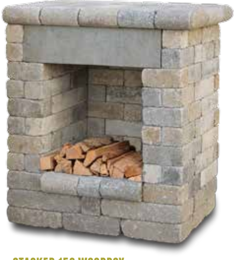
STACKER 150 WOODBOX

The Stacker 150 features a concrete lintel that matches the lintel found in the Serenity 100 and 150, whereas the Stacker 200 features an Arriscraft lintel.