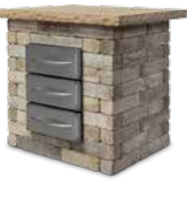
TRIPLE DRAWER CABINET