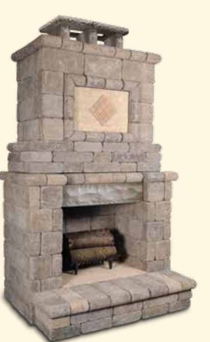
SERENITY 200 WITH ROCK-FACE LINTEL