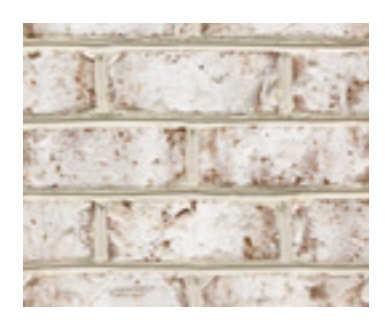
Bradford Hall Tudor | LWM, LWQ, LWE