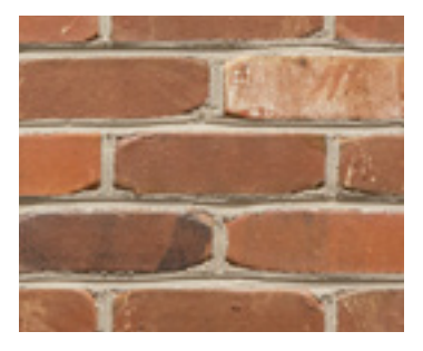
Phoenix | LWM, LWQ, LWE