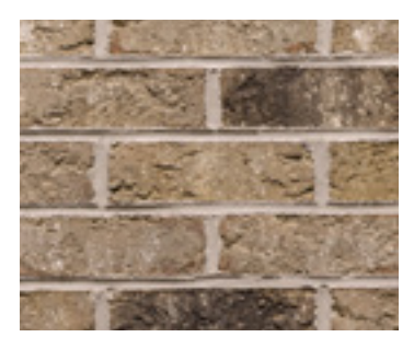
Colony Pointe | LWM, LWQ, LWE