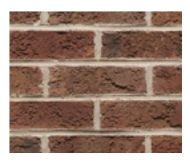
Millbrook | LWM, LWQ, LWE