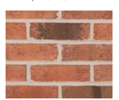
Monticello | LWM, LWQ, LWE