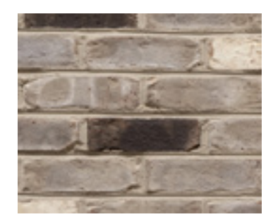
Cape Lookout | LWM, LWQ, LWE