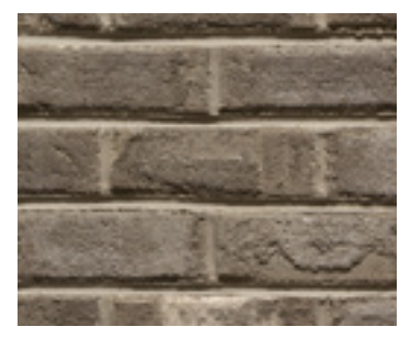
Stone Ridge | LWM, LWQ, LWE