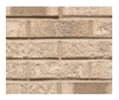
Old Marlborough | LWM, LWQ, LWE