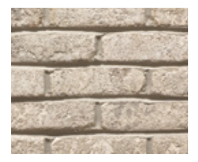
Hamilton | LWM, LWQ, LWE