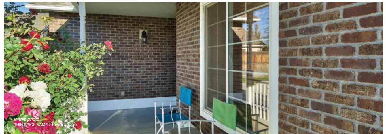
in this photo THIN BRICK NAME : Towerbridge