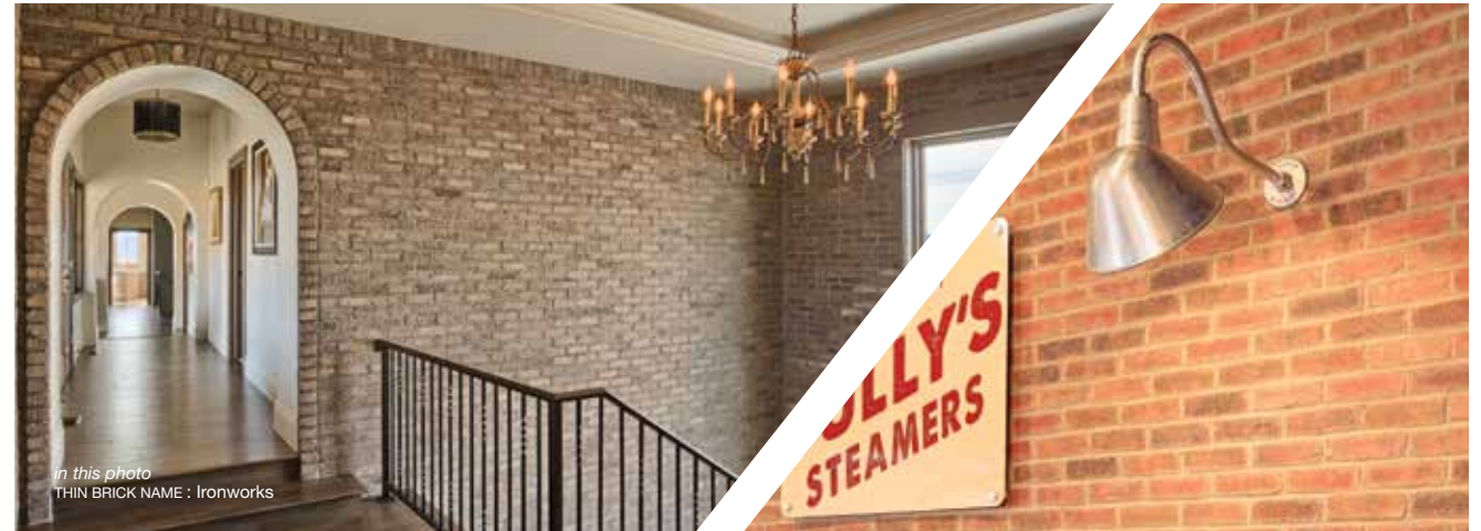
in this photo THIN BRICK NAME : Ironworks