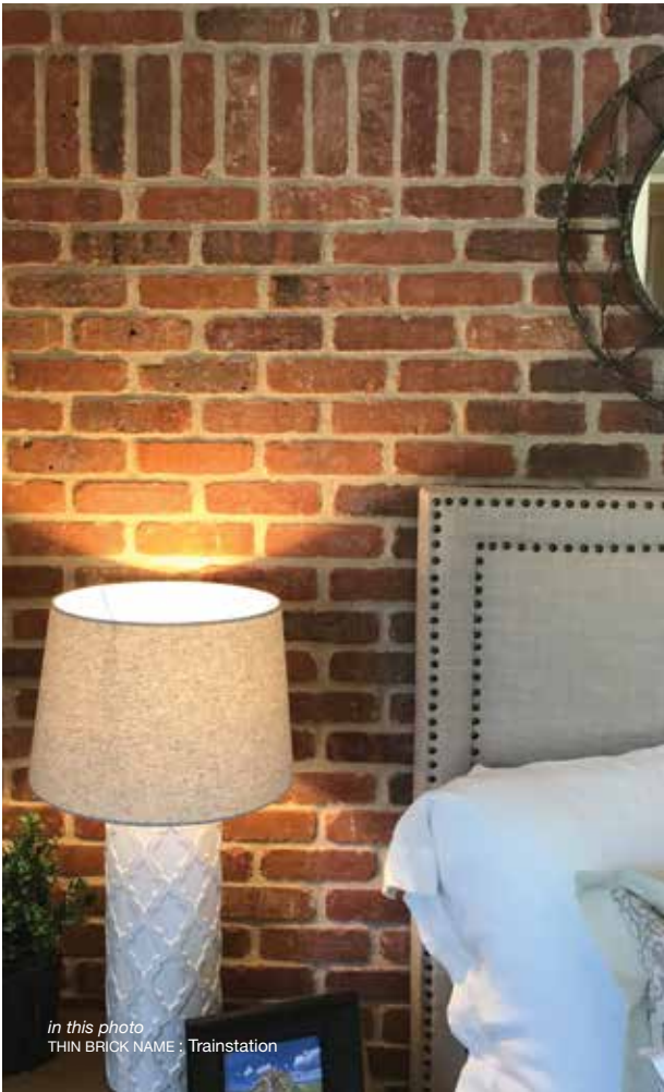
in this photo THIN BRICK NAME : Trainstation