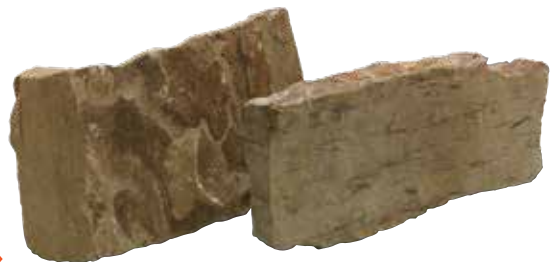
Thin Rock Corner & Flat ▶