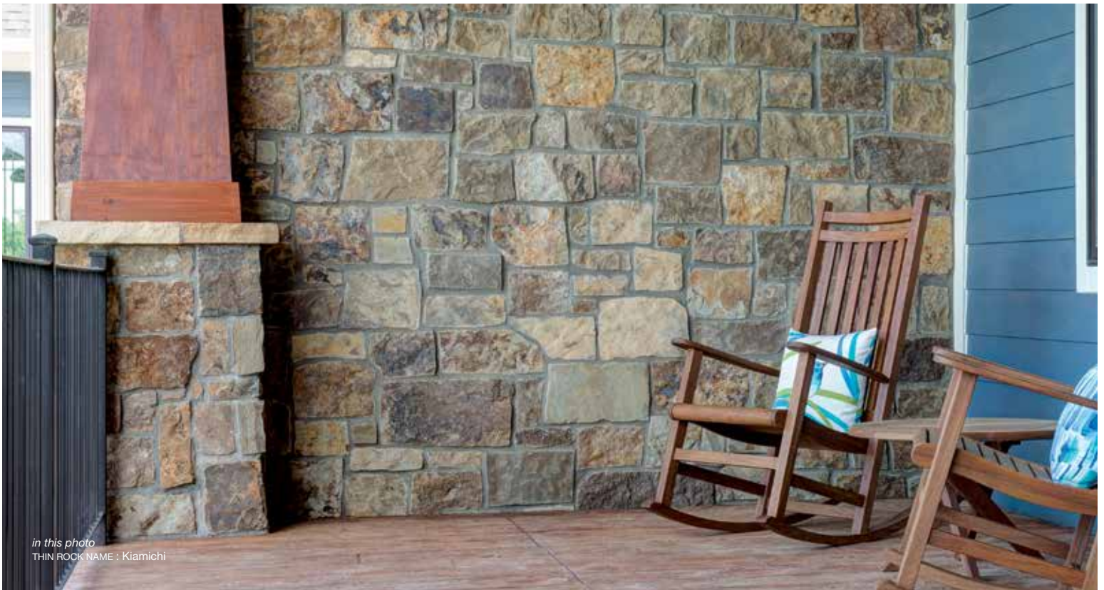
in this photo THIN ROCK NAME : Kiamichi