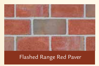
Please see your General Shale Representative for Patio Brick sizes.