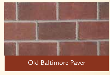
Please see your General Shale Representative for Patio Brick sizes.