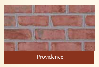
Available Sizes: LWM, LWQ, LWE