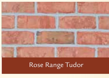
Available Sizes: LWQ