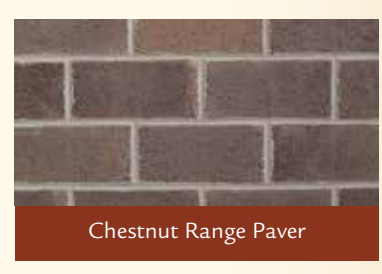
Please see your General Shale Representative for Patio Brick sizes.