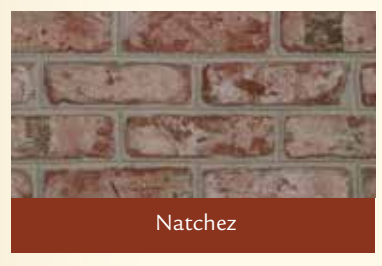
Available Sizes: LWM, LWQ, LWE