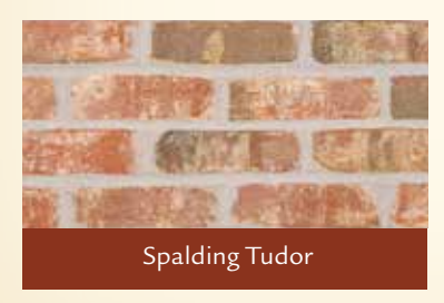
Available Sizes: LWM, LWQ, LWE