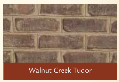
Available Sizes: LWM, LWQ, LWE