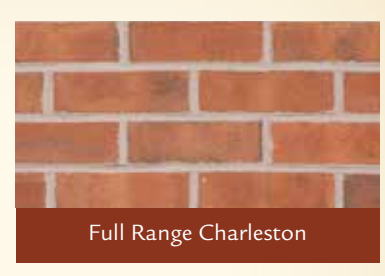
Available Sizes: LWM