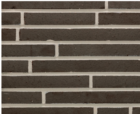
Bedford Brown ( Smooth )