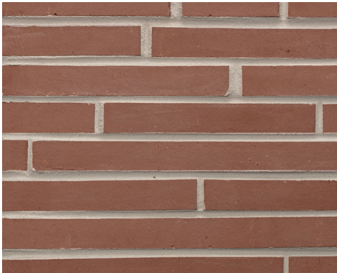
Manchester ( Smooth )