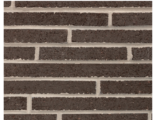
Wexford Fog ( Wire-Cut )