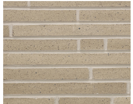
Keswick ( Smooth )