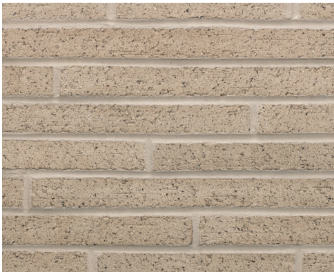
Andover ( Wire-Cut )

Impressionist Brick Series is a modern design choice for residential and commercial construction. Available product options include brown, gray, and red color tones with smooth and wire-cut texture options.