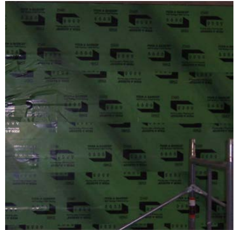
Step 3: Waterproofing Membrane