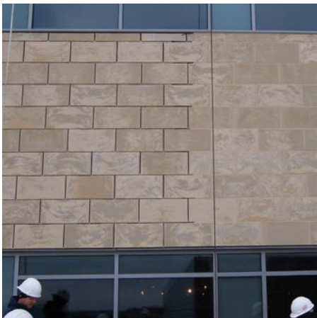
Step 7: Joints Sealed with Backer Rod and Silicone Sealant