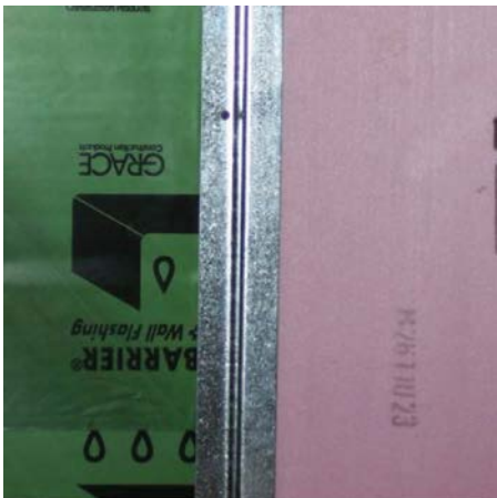
Step 4: Install "Z" channels and then Rigid Insulation between "Z" channels