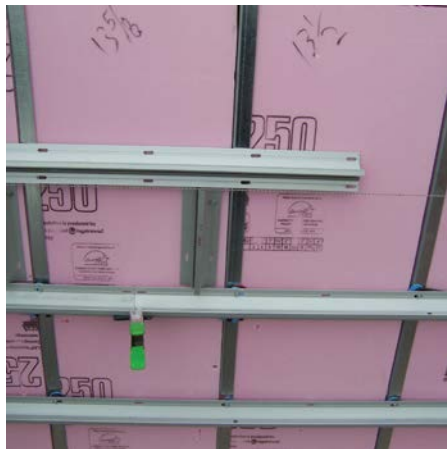
Step 5: Install Gridworx Channels over "Z" channels and rigid insulation