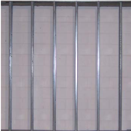
Step 1: Steel Studs