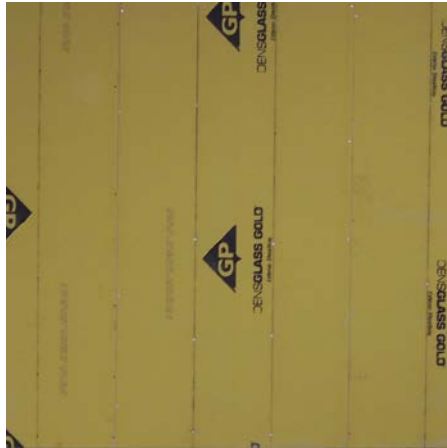
Step 2: Exterior Grade Sheathing