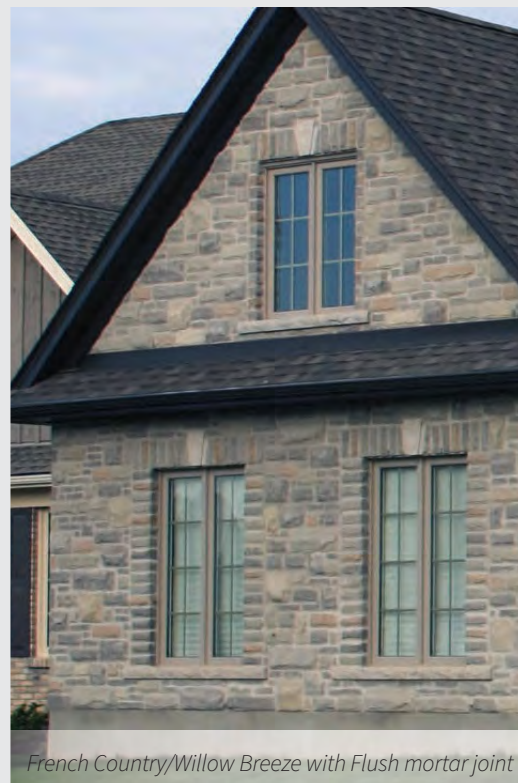
French Country/Willow Breeze with Flush mortar joint