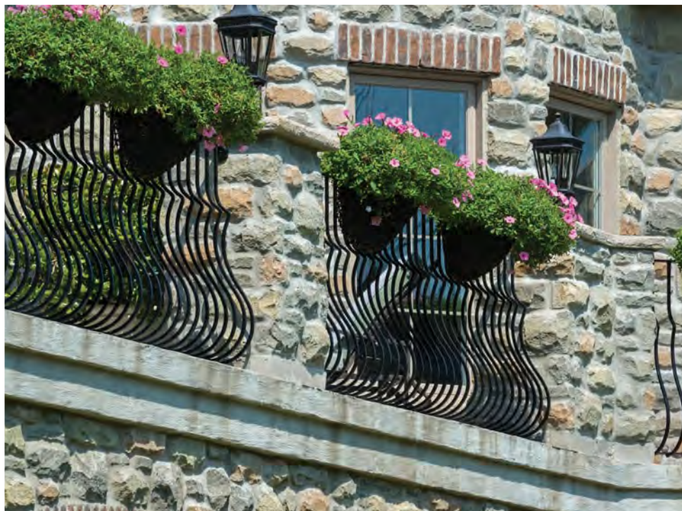
Custom Hewn French Country