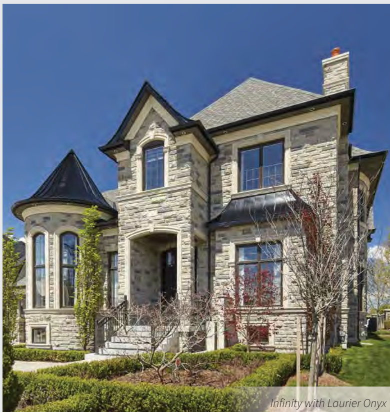
Infinity with Laurier Onyx