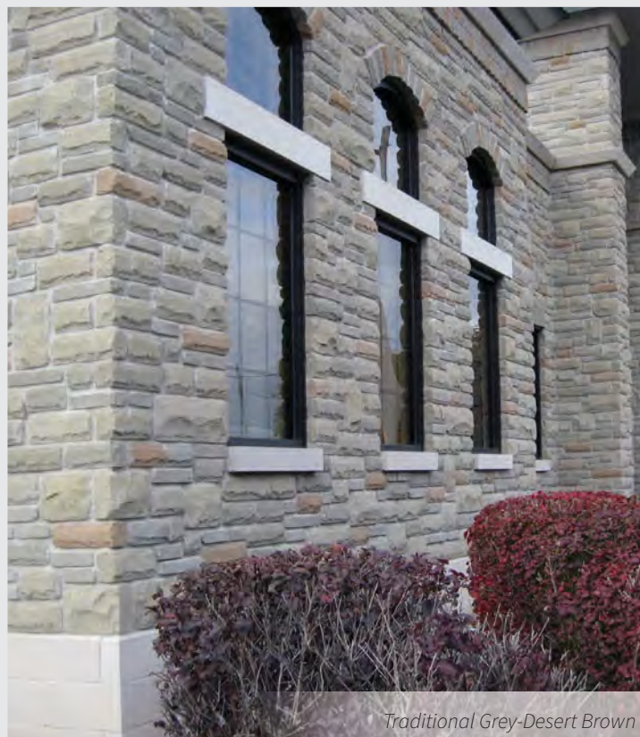
Traditional Grey-Desert Brown