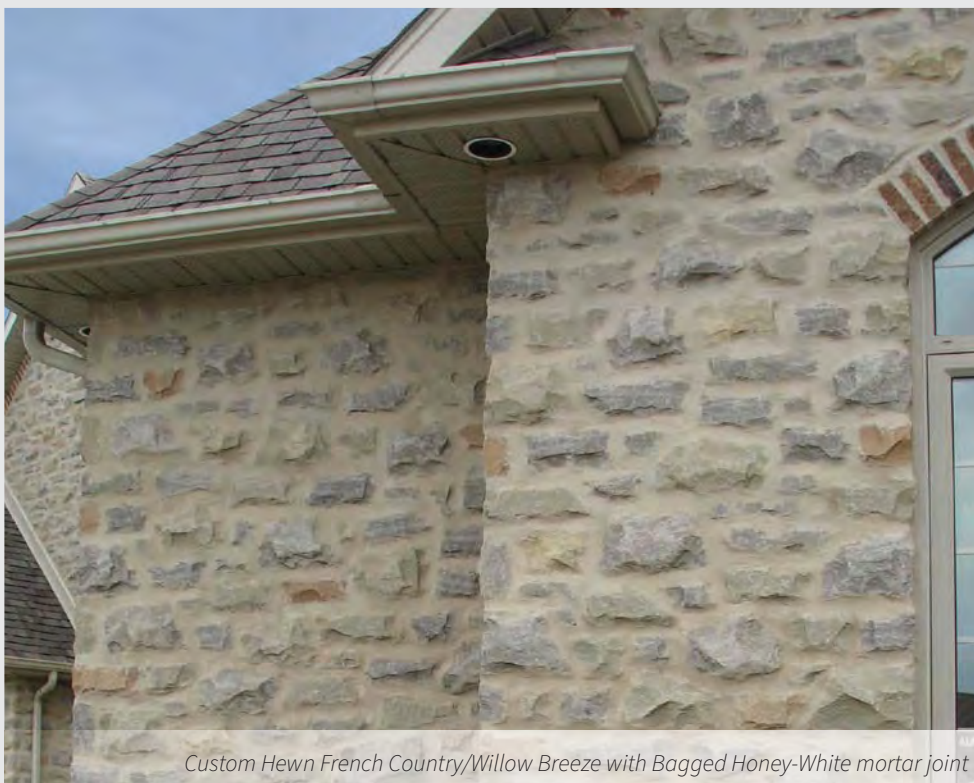
Custom Hewn French Country/Willow Breeze with Bagged Honey-White mortar joint