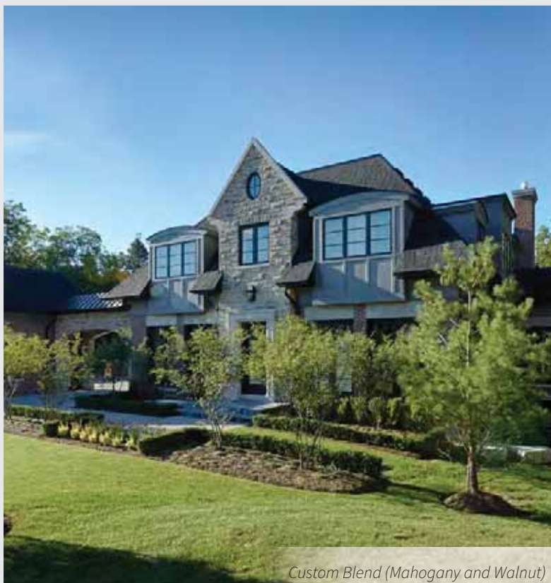
Custom Blend (Mahogany and Walnut)