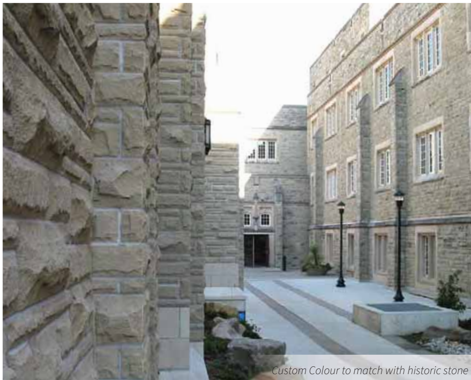
Custom Colour to match with historic stone