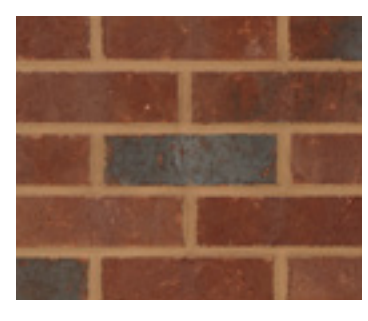
Rembrandt | LWM, LWK, LWQ