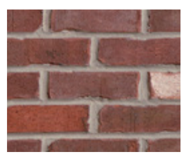
Old Louisville Tudor | LWM, LWQ