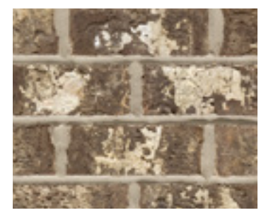
Scottsdale | LWM, LWK, LWQ