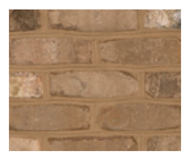
Stonefield Tudor | LWM, LWQ