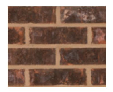
Innsbrook | LWM, LWK, LWQ