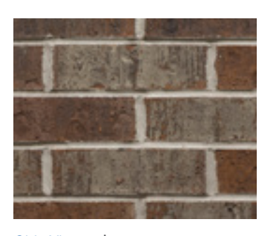
Olde Vienna | LWM, LWQ