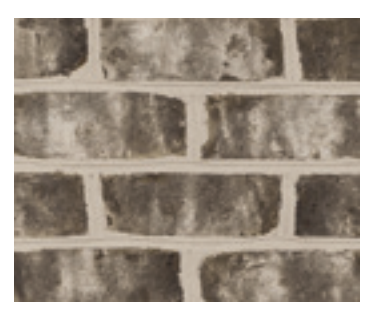
Everest Gray Tudor | LWM, LWQ